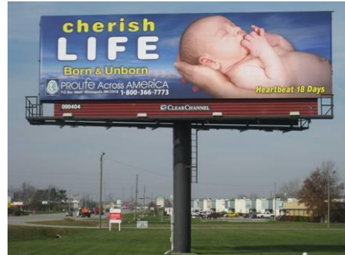
14'x48' on Brookville Rd and about Post Rd

For LIFE, Liberty and Pursuit of Happiness!